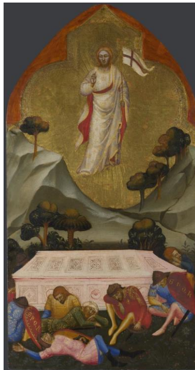
Jacopo di Cione and workshop 'The Resurrection: Upper Tier Panel', 1370-1 (The National Gallery)